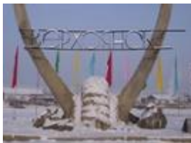
A monument at the entrance of Verkhoyansk, Russia, where it was 38 degrees Celsius in June 2020.

The World Meteorological Organization has announced a Siberian town reached 38 degrees Celsius (100.4 degrees Fahrenheit), marking a new record above the Arctic Circle. According to one meteorologist in Australia, the notation of the record is important because it provides a baseline for scientists to observe our climate's biggest extremes.